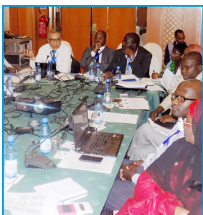
Knowledge Management workshop

The three Specialized Committees (SCs) of the Scientific and Technical Council met on Tuesday, February 24, 2015 to discuss specific sets of themes they were assigned with; particularly in the SC1, management and knowledge sharing, sharing the activities of the Young African Water and Sanitation Professionals.