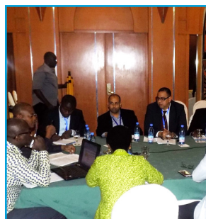
Young Professional workshop

SC2 and SC3, respectively in charge of Technical management, and sanitation and environment focused on non-revenue water, water quality or fecal sludge.