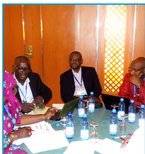
STCs president with members of the SC2

SC2 and SC3, respectively in charge of Technical management, and sanitation and environment focused on non-revenue water, water quality or fecal sludge.